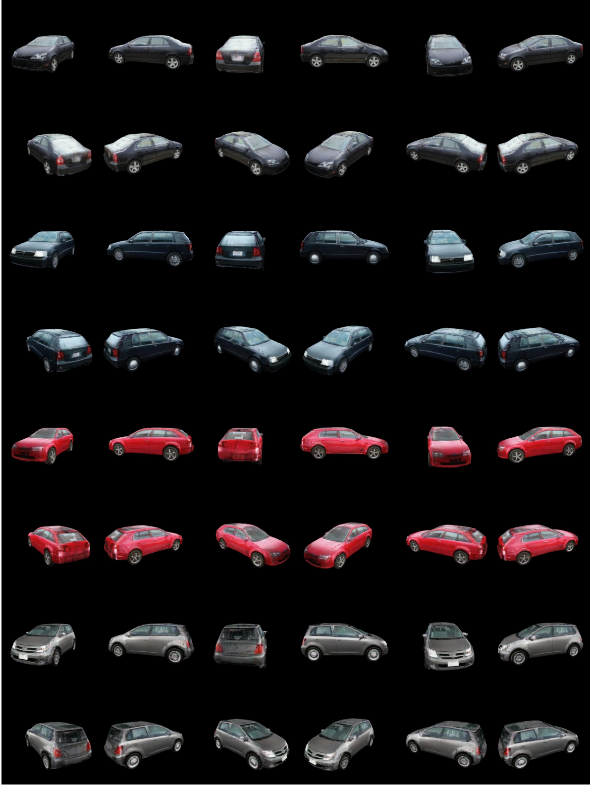
Figure 3. Novel view synthesis result of our generated objects.